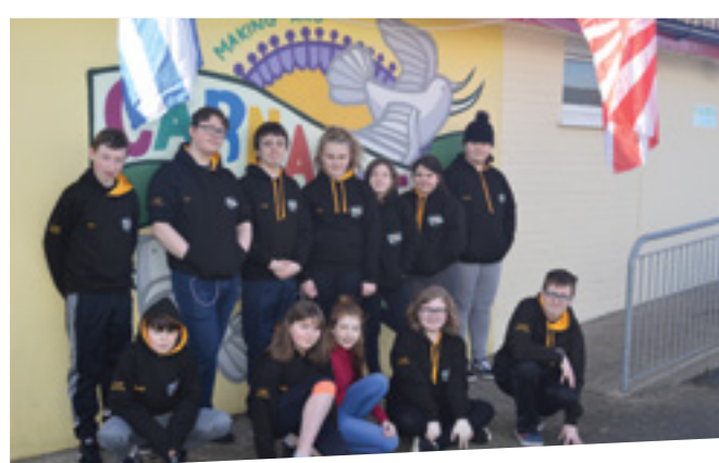
Carnagat Youth Group organised and participated in a cultural event for their community which included Chinese dancing, Bollywood dancing and African drumming. The children learned about other cultures and traditions and developed skills in leadership, budgeting and communication.