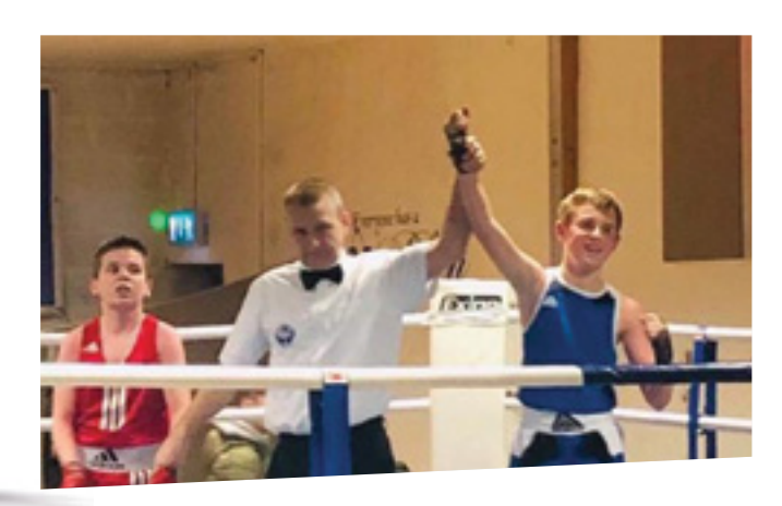
Bryansford Amateur Boxing Club gained funding for new equipment for their club. Now they are fighting fit and able to compete. The new equipment promotes good health through exercise.