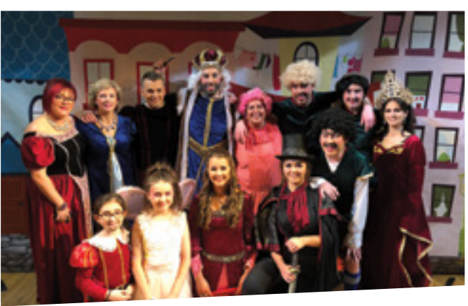
Upper Creggan Pantomime Group the children put on a pantomime called Ole King Cole which they enjoyed thoroughly. Friendships where made and confidence grew which positively impacted their health and wellbeing.