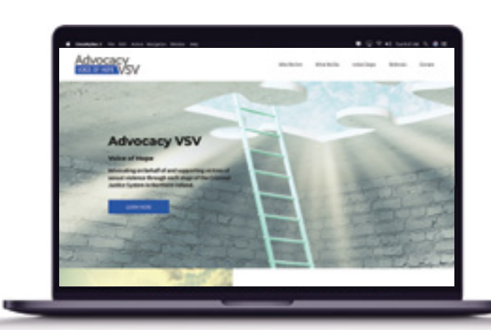
Advocacy VSV gained funding to design a new Website and fliers to promote this new charity that helps victims of sexual violence. Based in Newcastle. www.advocacyvsv.com