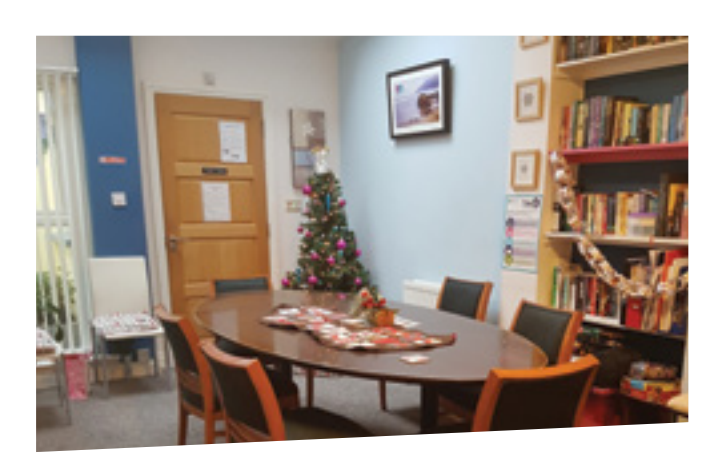
MYMY gained funding to give their crisis room a facelift. 20 people got involved in helping with the painting and decorating of the room. Improvements have been made to make the room more inviting which encouraged more drop in sessions. The service users now feel the room is cleaner and of a higher standard. "This has made a huge difference to the overall feel of the house and we are very grateful for the grant"