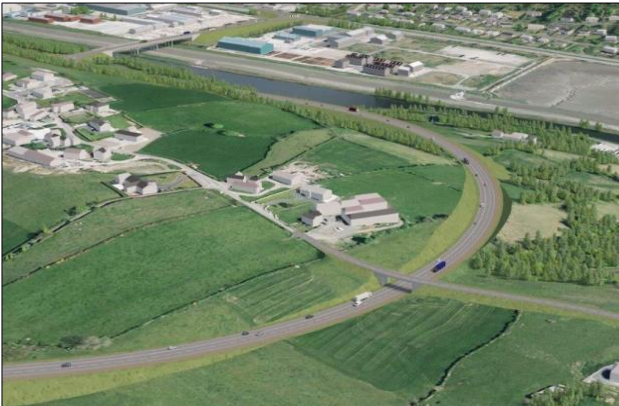
A view of the proposed Newry Southern Relief Road at Flagstaff Road

https://www.infrastructure-ni.gov.uk/articles/newry-southern-relief-road-overview