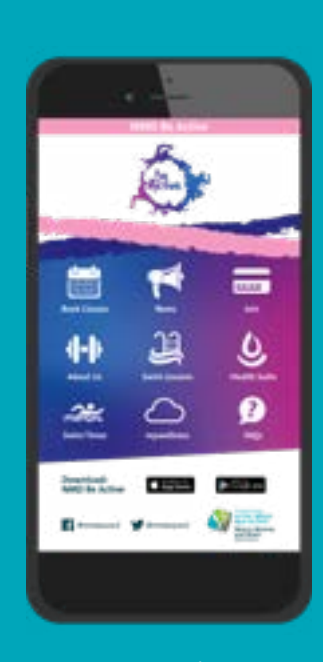
NMD Be Active app