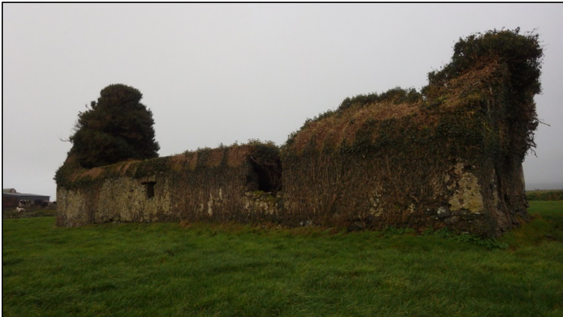
4. Greencastle Church. The ASAI contains a range of heritage assets with discrete and overlapping settings, sometimes having a close functional relationship in the landscape with each other.