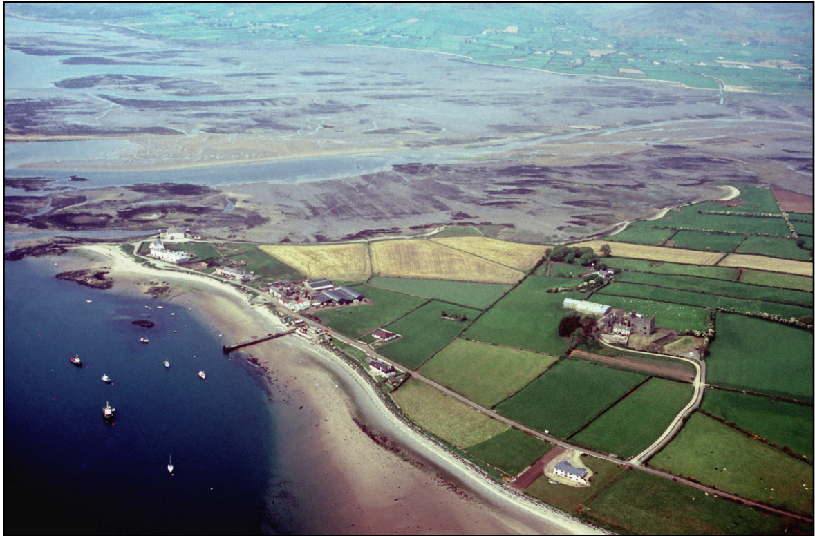
3. The landscape in the western part of the ASAI, characterised by a flatter topographical morphology with occasional rises, is particularly important and the castle would have exerted a particularly strong influence over the cultural evolution of the area west of the historic river crossings