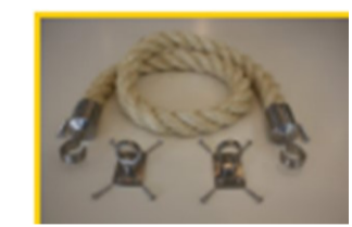
proposed barrier finish

around red lined to demarcate the island service area