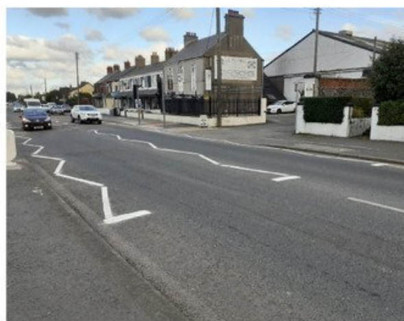
A2 Dundrum Road, Newcastle