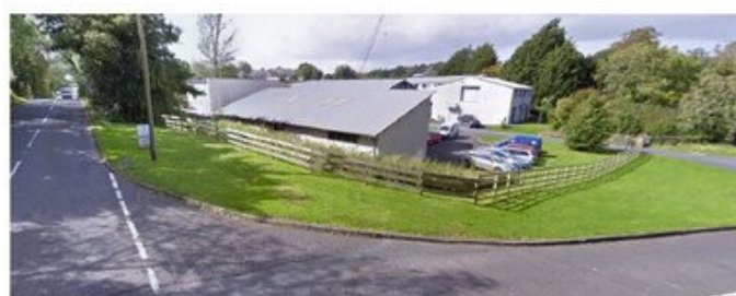
Before the works