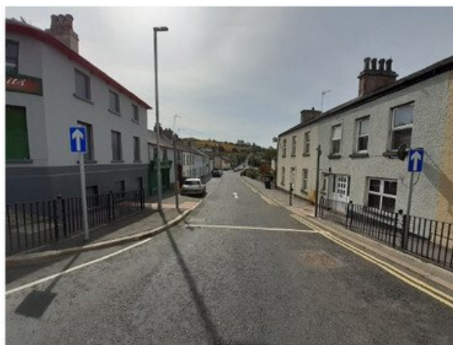
Stream Street - one way traffic system