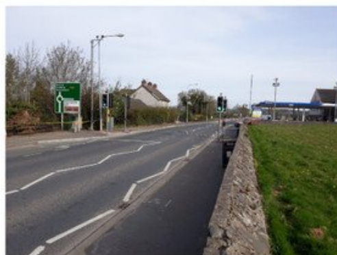
Main Street, Clough