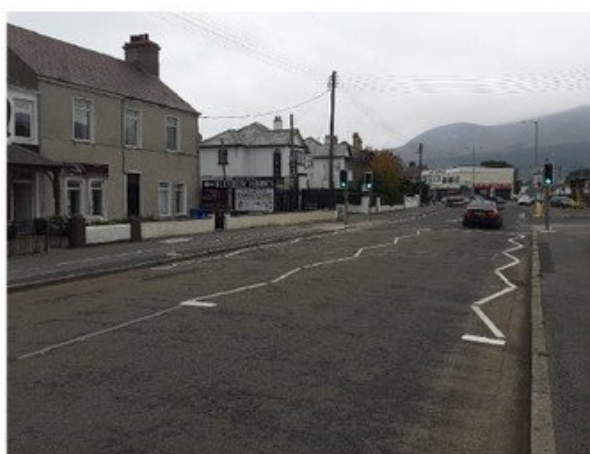
A2 Dundrum Road, Newcastle