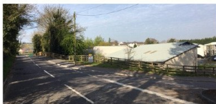
After provision of the new footway