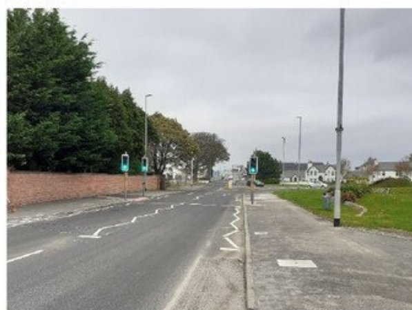
A50 Castlewellan Road Newcastle

PUFFIN CROSSINGS are relatively new in Northern Ireland and further information on their use is available at NI Direct website at: www.nidirect.gov.uk/articles/puffin-crossing