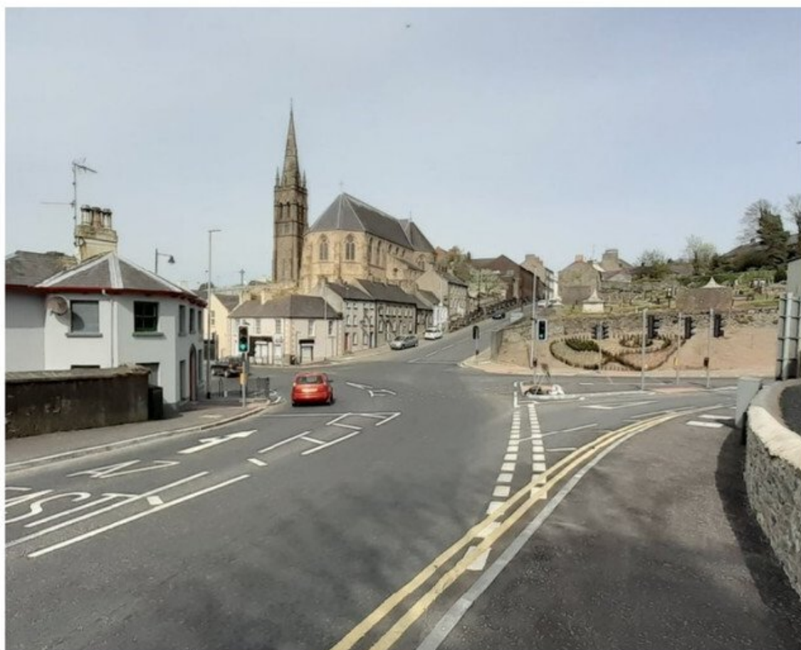
Collins Corner, Downpatrick