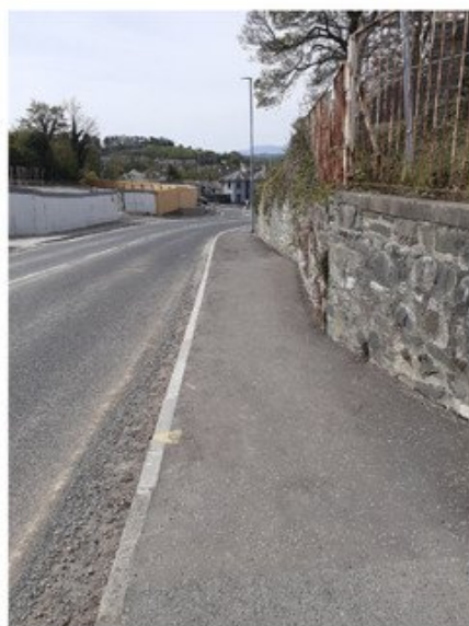
Killough Road, Footway