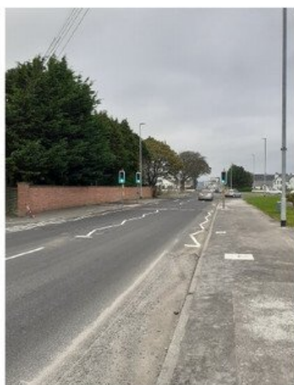
A50 Castlewellan Road. Newcastle

The crossing on Castlewellan Road, adjacent to Dunwellan Park was relocated to the north of the junction, with a new linking footway to the new PUFFIN crossing on Dundrum Road.