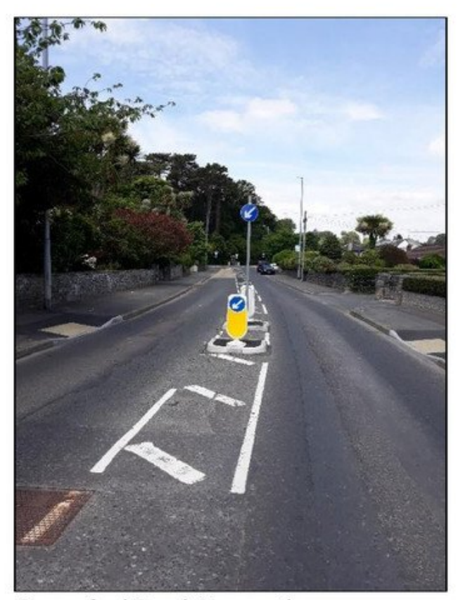
Bryansford Road, Newcastle