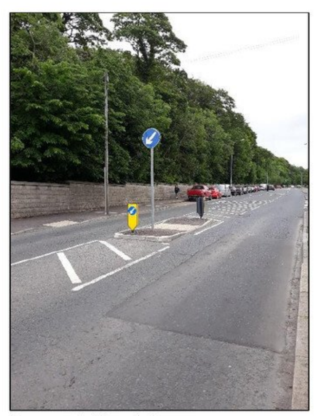
Downpatrick Road, Crossgar