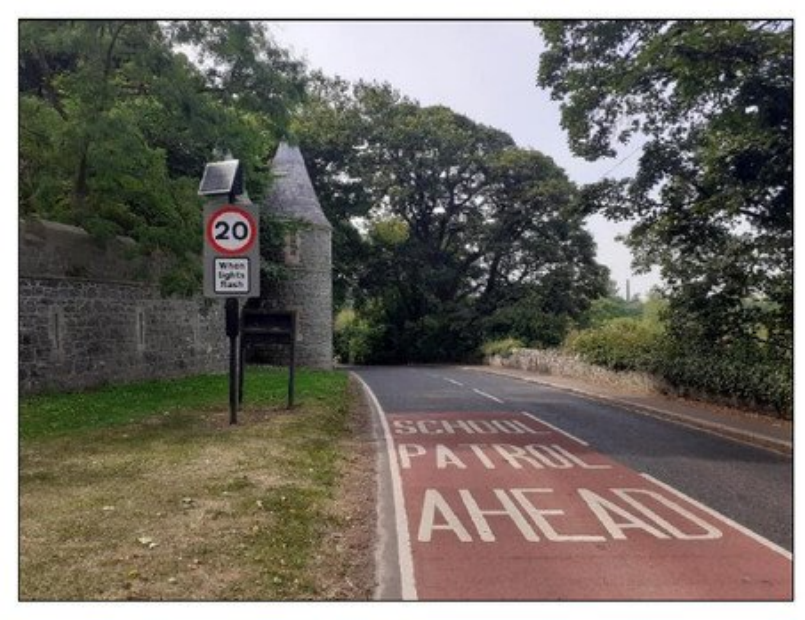
Killyleagh Primary School