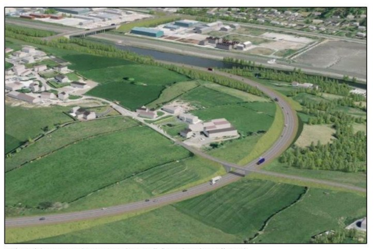
A view of the proposed Newry Southern Relief Road at Flagstaff Road

To find out more about the scheme visit https://www.infrastructure-ni.gov.uk/articles/newry-southern-relief-road-overview