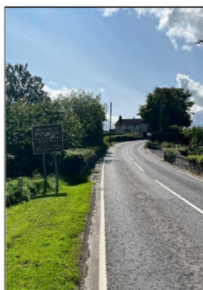
Ballylough Road, Castlewellan