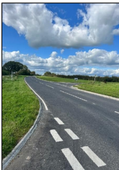
Downpatrick Road, Ardglass