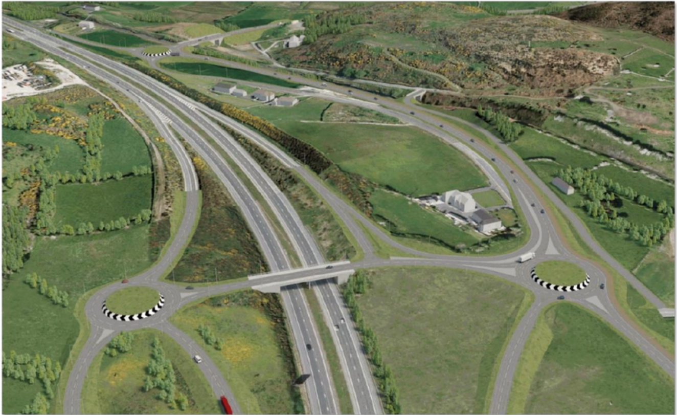
Image of Ellisholding Road Junction at A1