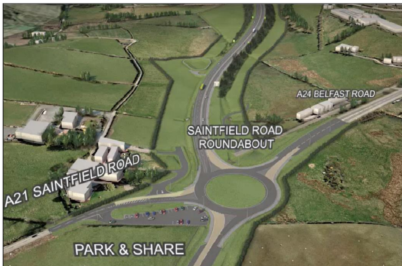
Image of Northern Junction at Saintfield Road