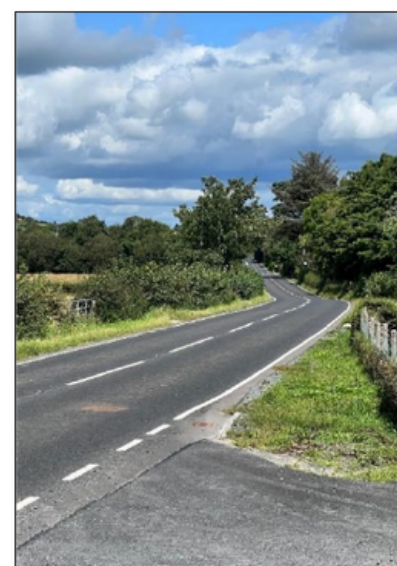
Drumaroad Hill, Ballynahinch