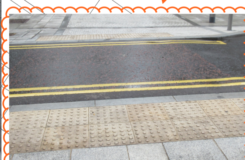
UNCONTROLLED CROSSING [ALL AREAS CLOUDED ORANGE= UNCONTROLLED CROSSINGS]