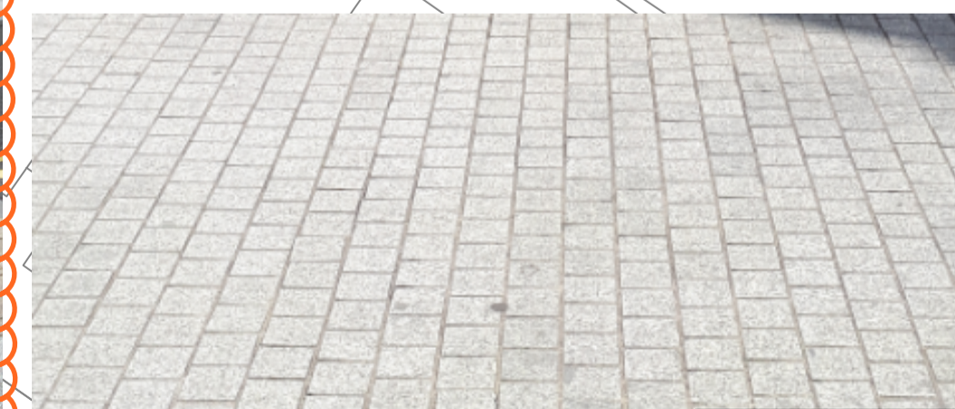
GRANITE SETTS TO MATCH PREVIOUS SCHEMES