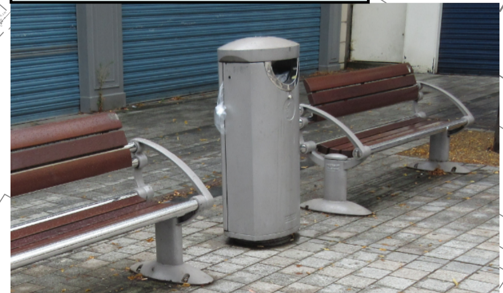
LITTER BIN & SEATS TO BE LOCATED AWAY FROM DESIRE LINES