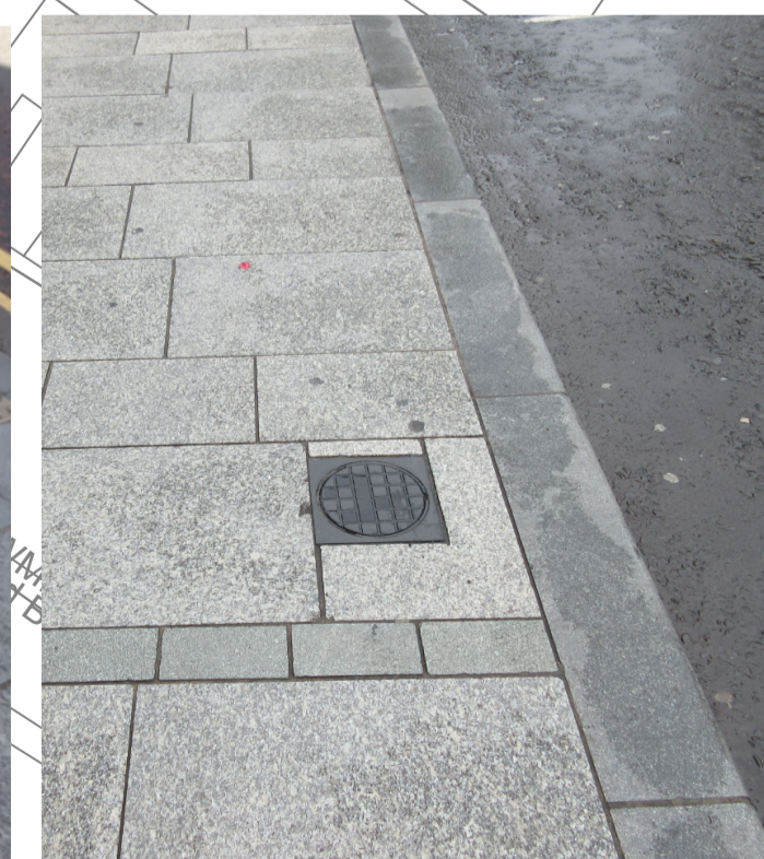
GRANITE PAVING & KERBS TO MATCH PREVIOUS SCHEMES