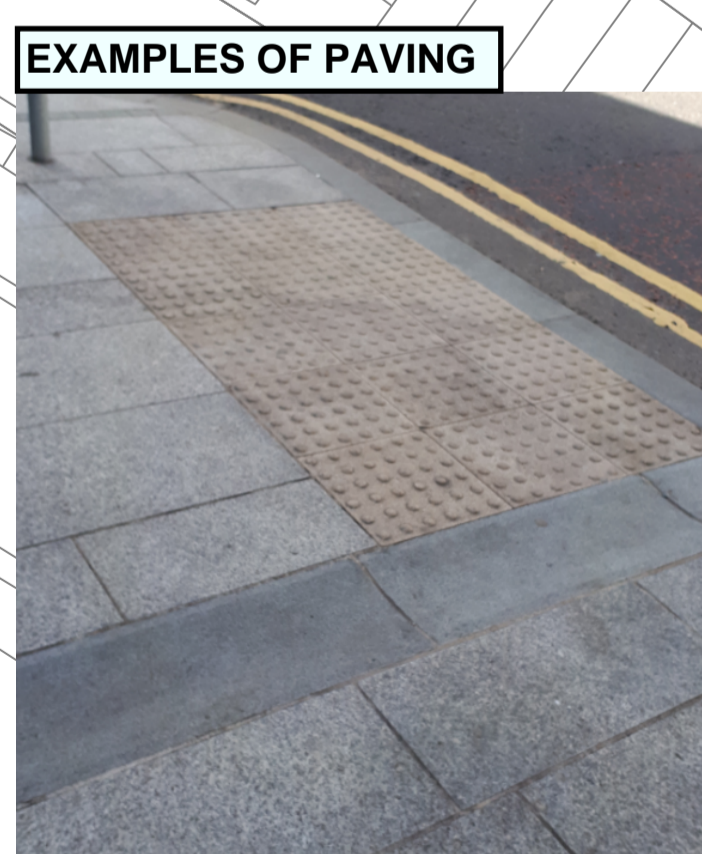
SHALLOW DISH CHANNEL