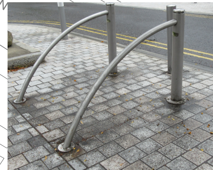
CYCLE STANDS & BOLLARDS TO BE LOCATED AWAY FROM DESIRE LINES