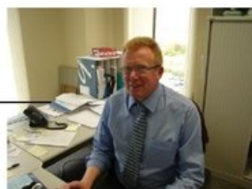
Neville Dynes Strategic Road Improvements Marlborough House Central Way Craigavon BT641AD

Tel: 0300 200 7892 E-mail: transportni.southern@infrastructure-ni.gov.uk