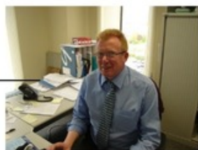
Neville Dynes Strategic Road Improvements Marlborough House Central Way Craigavon BT641AD

Tel: 0300 200 7892 E-mail: transportni.southern@infrastructure-ni.gov.uk