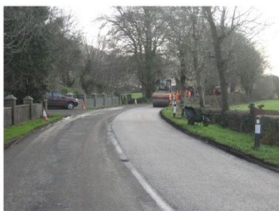
During carriageway resurfacing work