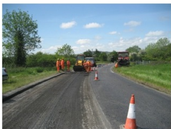
During carriageway resurfacing work

Work on this scheme was completed in July 2015