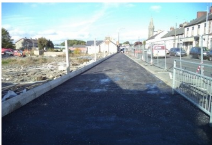
Downpatrick Street, Crossgar