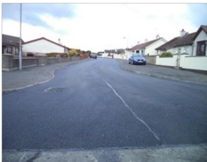
Crookoona Park, Kilkoo