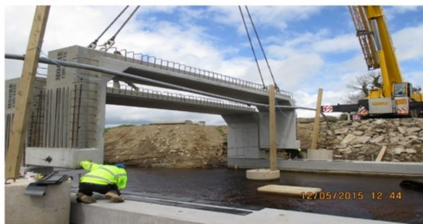
Bridge under construction

Other structures strengthened during the period -